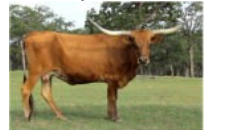
WORKING MAN CHEX