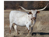
FLAME CHEX 212